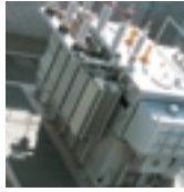
8 MegaWatt 60kV substation delivering 10,000 Amps of 480 Volt power to a data center. Sacramento, CA