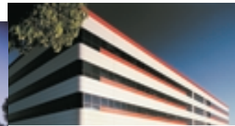
Laboratory and office building expansion of a major semiconductor manufacturer's R&D campus. Folsom, CA