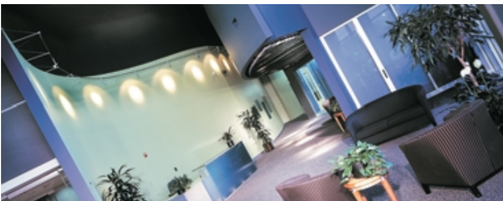
Hi-tech lobby lighting designs. Sacramento, CA

Just as important is our shared sense of community. Our roots and families are here in the Sacramento area, and as a company we're committed to supporting local children's charities, schools and other nonprofit agencies. We embrace the opportunity to give back to the people that comprise this great community.