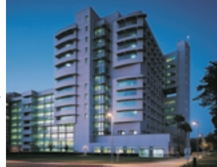
State-of-the-Art Critical Care Adult and Pediatric hospital. UC Davis Medical Center—Davis Tower. Sacramento, CA