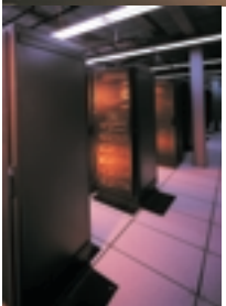
54,000 square foot raised floor at State-of-the-Art Data Center. ◀ Sacramento, CA

To say we can handle virtually any job is a powerful statement – but nonetheless we say it with conviction. From multi-million dollar design build projects to smaller service jobs... from public ventures to private enterprise... Schetter Electric welcomes project diversity, fast-track accelerated timelines, unique applications and implementation of the latest electrical innovations.