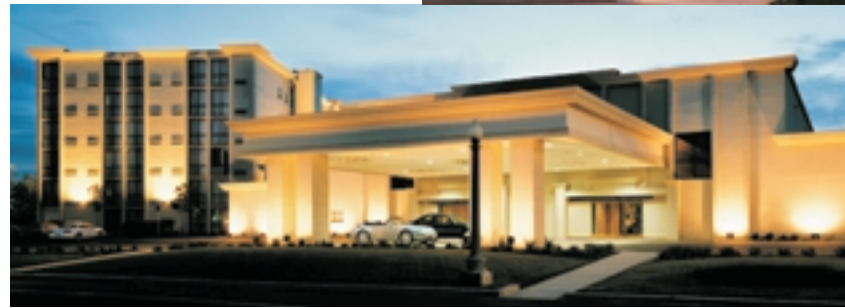
Design build lighting renovations— Holiday Inn. Sacramento, CA

Regardless of the size or scope of your job, Schetter Electric is with you every step of the way. A designated team, including a project manager, job foreman and shop superintendent, oversees each phase of your project – from concept to design to installation – all the while encouraging communication and serving as your construction liaison. Throughout your project, we look at ways to prevent potential problems, address existing concerns and recommend cost-effective solutions. Our team approach gives you the attention you deserve, and the result is a project completed on time, within budget and to your utmost satisfaction.