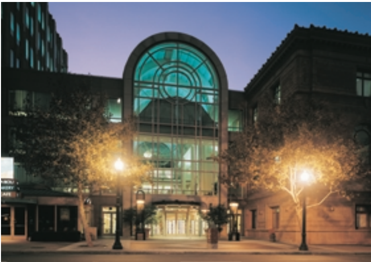
◀ Monumental institutional facilities— Sacramento Central Library Plaza. Sacramento, CA