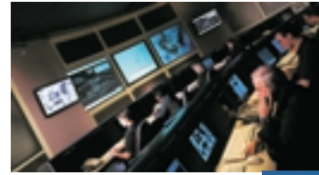
Network Operation Centers— Herakles Data Center. Sacramento, CA